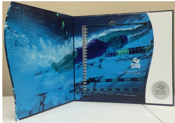
2016 Olympic Swim Trials Bid

The Bid Book itself was a unique spiral bound edition in a large format that showcased Greensboro and the Triad region as top major event host city. Even USA Swimming, the organization conducting the bid process, indicated the presentation of the bid that included both printed and electronic versions in deluxe Box Set packaging was unsurpassed.